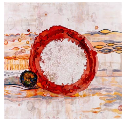
Work by Meg Homeier

Park Circle Gallery , formerly the Olde Village Community Building, 4820 Jenkins Avenue, in the bustling Park Circle neighborhood of North Charleston. Through Nov. 30 - "Texture and Light," featuring mixed media works by Meg Homeier. A reception will be held on Nov. 1, from 5-7pm. In her exhibit, Johns Island-based artist Meg Homeier explores ambiguous landscape themes using the mediums of acrylic polymers, alcohol inks, and various other natural materials such as mica flake imbedded into the artwork. Through Nov. 30 - "To All the Lives We've Lived," featuring mixed media works by Visceral Home. A reception will be held on Nov. 1, from 5-7pm. Artist duo Taylor & Connor Robinson present hand-crafted textured sculptural paintings and reliefs under their trade name Visceral Home. The pair presents a collection of works created using a variety of hard and soft natural elements that explore the cycles of transformation, resilience, and rebirth inherent to the human experience. Ongoing - In addition to the monthly exhibitions, the "gift shop" at the North Charleston City Gallery, which features a variety of items by local artists, will also be moved to PCG. Cultural Arts will also continue to host art workshops and recurring meetings for art groups and guilds in the space once gatherings are safe to resume. Admission: Free. Hours: Wed.-Fri., 11am-6pm & Sat., noon-4pm. Contact: 843/740-5854, or at (https://www.northcharleston.org/residents/arts-and-culture/).