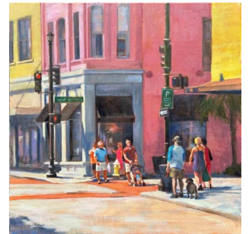
Work by Junko Ono Rothwell

The Sportsman's Gallery , 165 King Street, Charleston. Ongoing - Featuring one of the largest, most diverse collections of contemporary sporting and wildlife art found today and once having viewed it, we are confident you will concur. Hours: Mon.-Fri., 10:30am-5:30pm, Sat., 11am-5pm or by appt. Contact: 843/727-1224 or at ( www.sportsmansgallery.com ).