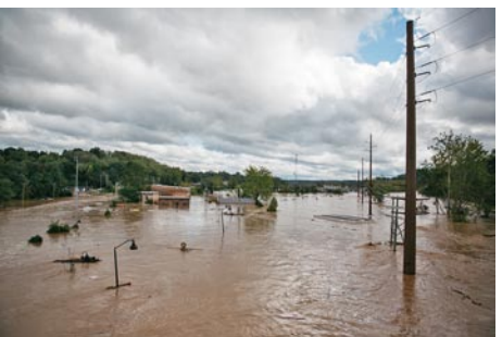
The River Arts District just after Hurricane Helene

River Arts District, Asheville. November 2024 - "The RAD Studio Stroll Is Not Taking Place Due To Hurricane Helene". The 240+ artists of Asheville's River Arts District will NOT be opening their doors for a full weekend at the Fall Studio Stroll welcoming visitors, from near and