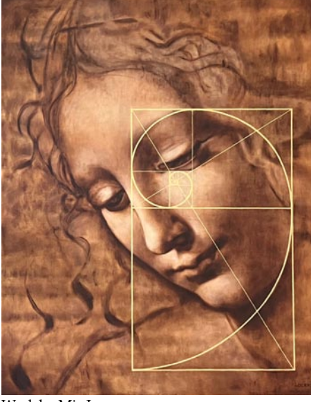
Work by Mia Lucero

Pittsboro Gallery of Arts, 44-A Hillsboro Street, a few steps north of the County Courthouse circle, in Pittsboro. Nov. 15, from 5-8pm - "Thankful Friday". Ongoing - When you visit Pittsboro Gallery of Arts you'll find it's a destination gallery situated in a historic, bustling small town at 44-A Hillsboro Street. This spacious and newly redesigned gallery is owned and operated by local and regional artists, whose