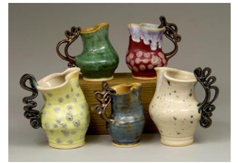
Works from Turtle Island Pottery

Turtle Island Pottery, 2782 Bat Cave Road, Old Fort. Ongoing - Featuring handmade pottery by Maggie and Freeman Jones, who create one of a kind, functional, decorative stoneware items. From cups to umbrella stands, mirror frames and clocks. Sculptural and inspired by nature, many forms are reminiscent of antique pottery from the arts and crafts movement and art nouveau styles. Hours: Showroom open most Saturdays, call ahead for