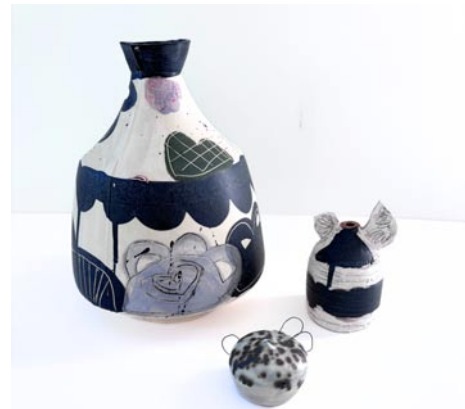
Work by Beth Elliott

For further information check our SC Commercial Gallery listings, call the gallery at 864/252-5858 or visit ( www.artandlight-gallery.com ).