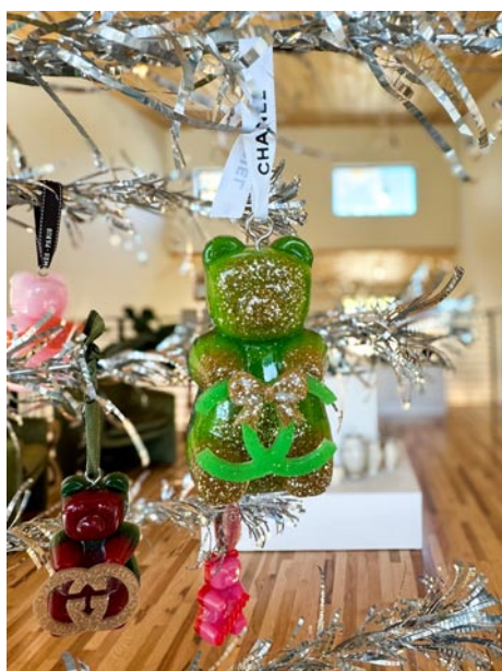
Works by Amy Shekhter

Located on Pendleton Street, Spoonbill Gallery invites the community to explore this celebration of artful holiday expression,