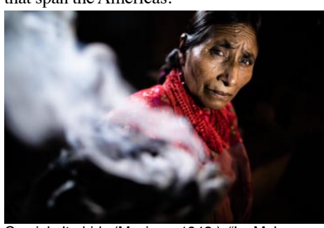
Graciela Iturbide (Mexican, 1942-). "La Mujer Angel," 1979, gelatin silver print. Museum purchase made possible by Allen Blevins & Armando Aispuro and the Charles W. Beam Endowment.

Women of Land and Smoke: Photographs by Graciela Iturbide and Maya Goded (Las Mujeres de Tierra y Humo: Las Fotografías de Graciela Iturbide y Maya Goded), includes over 50 photographs that present an overview of Iturbide's and Goded's careers that span the Americas.