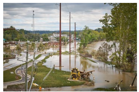
River Arts District in Asheville after flooding after Hurricane Helene

Expanding Relief Through a Multi- Phase Approach