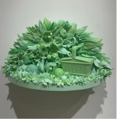
Work by Amber Cowan

Her recent diorama-style pieces tell stories of self-discovery, escapism, and the power of the feminine by utilizing figurines and animals found in collected antique glass pieces.