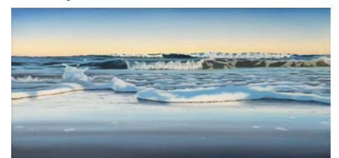
Work by KC Collins

Local artist KC Collins invites art lovers and coastal enthusiasts to explore her latest exhibition, Tides of Color , showcasing a vibrant collection of oil paintings inspired by the beauty of the South Carolina coastline.