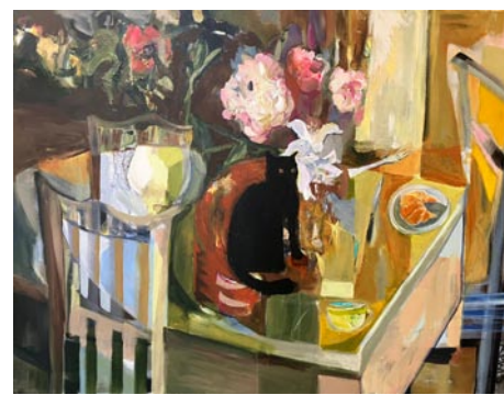
Work by Kaidy Lewis

African American Atelier & Bennett College for Women Gallery , Greensboro Cultural Center, 200 N. Davie Street, Greensboro. Ongoing - Featuring works by local, regional and national African American artists. Hours: Tue.-Sat., 10am-5pm; Wed., till 7pm & Sun., 2-5pm. Contact: 336/333-6885.