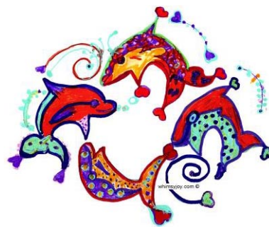
"Circle of Love"