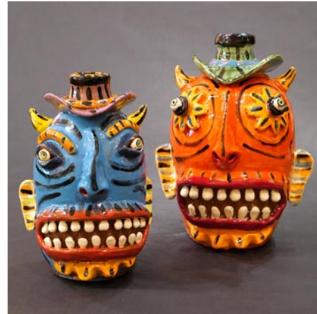
Works by Carl Block

Aesthetic Gallery , 6 College St., across from Pritchard Park, Asheville. Ongoing - Offering a variety of international works, including terracotta ceramics from Viet Nam and stone sculpture from Zimbabwe. In addition, there is an assortment of intricately detailed handcrafted pictorial textiles from Australia and Lesotho, many of which depict local Asheville scenes. Also available are Australian Aboriginal oil paintings, Bruni Sablan oil paintings from the "Jazz Masters Series," and ceramic tiles from the Southwest (US). Hours: Tue-Sat, noon-6pm. Contact: 828/301-0391 or at ( www.aestheticgallery.com ).