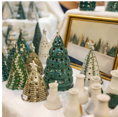
View from a previous Holiday Market at the Sawtooth School for Visual Arts