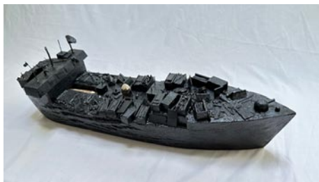
David Finn, “F You Up,” wood and mixed media, 2024..

Page Laughlin’s artwork has been selected for over 43 competitive exhibitions, including 11 museum exhibitions, 10 solo exhibitions or installations, and