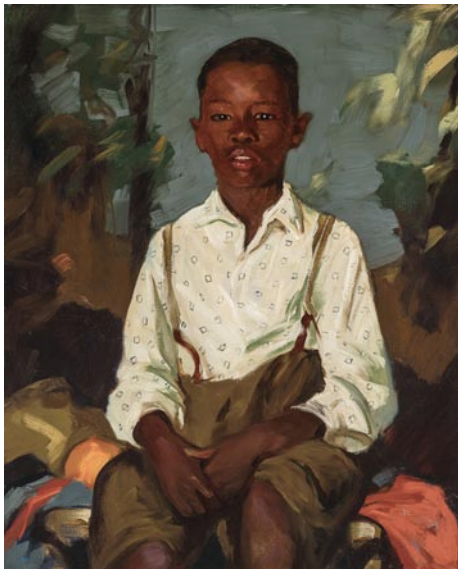
Robert Henri, American, (1865 – 1929), "Sylvester", 1914, oil on canvas. 32 x 26 in. (81.3 x 66 cm); frame: 39 1/4 x 33 1/4 in. (99.7 x 84.5 cm). Terra Foundation for American Art, Daniel J. Terra Art Acquisition Endowment Fund, 2017.2, L2023.2.4

Cumulatively, Triple Take invites the visitor to experience the Terra Foundation loans in a new way. The three contrasting curatorial approaches show how Ackland's rich and deep collection can create a space for reinterpreting works of art.