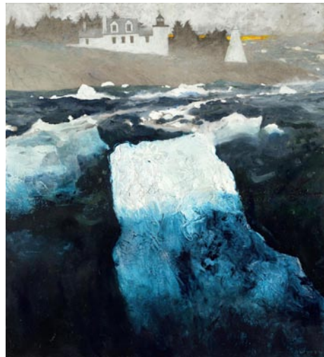
Jamie Wyeth (b. 1946) "Berg," 2011, watercolor, gesso, and enamel on joined rag boards ©Jamie Wyeth / Artists Rights Society (ARS), New York

Greenville Center for Creative Arts , 25 Draper Street, Greenville. Main Gallery, Through Jan. 29 - "Past is Prologue," featuring works by Arden Cone. The Shop at GCCA - In celebration of our eighth anniversary, Greenville Center for Creative Arts is thrilled to announce the opening of our official gift shop! As another opportunity for GCCA to support local artists, visitors can shop for consigned artworks from Greenville-based artists including prints, small originals, jewelry, pottery, and more! The Shop at GCCA will also have novelty merchandise for sale so you can show your love for Greenville arts everywhere you go! Ongoing - Home to 16 studio artists. Hours: Wed.-Fri., 1-5pm. Contact: call 864/735-3948 or at ( www.artcentergreenville.org ).