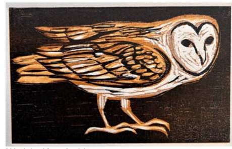
Work by Kent Ambler

The artwork in this show might be limited in size, but there are never any restrictions on subject or spirit! Dedicated to small but mighty masterpieces, this year's show will feature new work from 16 of