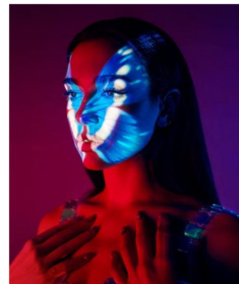
David LaChapelle, "Dua Lipa: I See in Blue" (detail), 2020, pigment print.

At age 17 LaChapelle moved to New York City. Following his first photography show at 303 Gallery, he was hired by Andy Warhol to work at Interview magazine. Through his mastery of color, unique composition, and imaginative narratives, LaChapelle began to expand the genre of photography. By 1997 the New York Times predicted he "is certain to influence the work of a new generation ... in the same way that Mr. [Richard] Avedon pioneered so much of what is familiar today" in portrait and fashion photography.