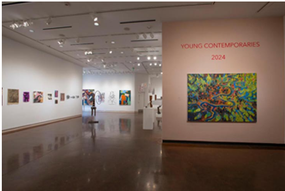
Installation image by Rick Rhodes Photography of a previous exhibition.

The Collage of Charleston in Charleston, SC, will present Young Contemporaries 2025 , on view at The Halsey Institute of Contemporary Art, from Feb. 7 through Mar 15, 2025.