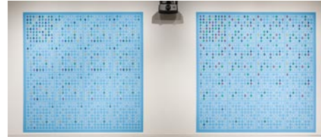
"Processing Systems: Bonding" by Sherrill Roland.

and to lift the veil of shame associated with the loss of breasts, hair, nails, and changes in skin tone – challenges often mistakenly viewed as a loss of femininity. These visually captivating, crocheted artworks advocate for awareness and support of breast cancer's impact on 1 in 8 women in the United States. The bras symbolize hope and celebrate the strength of women who have triumphed over breast cancer as well as those currently facing its challenges. The visual presentation invites conversations about cancer, breasts, image, femininity, beauty, and the impact of breast cancer on all women through a clothing item that women wear." For further information call the Center at 828/262-3017 or e-mail to ( turchincenter@appstate.edu ).