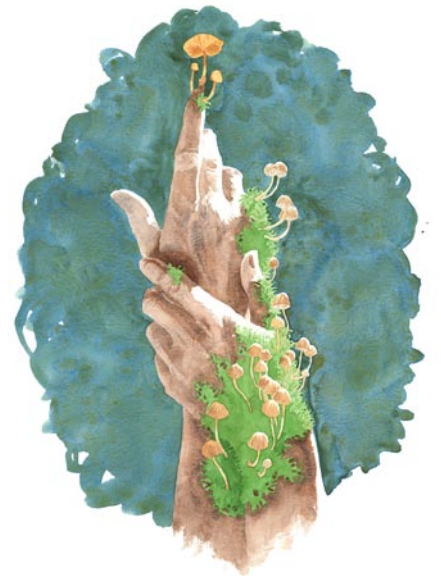
Work by Heather Clements

Throughout downtown Spartanburg's Cultural District, Ongoing - The Creative Crosswalk Project is a public art initiative in which local artists and designers design and paint a series of crosswalk murals, transforming the crosswalks into works of art, on Main Street in Spartanburg, SC. The downtown cultural district area is often bustling with events and pedestrians, and the pedestrians rely heavily on a multitude of crosswalks to safely traverse the downtown Spartanburg area. The problem is that crosswalks are incredibly easy to overlook, they are rarely visually appealing, and they can even be quite dangerous. In an effort to remedy these issues, Chapman Cultural Center, the City of Spartanburg, and the Spartanburg Area Chamber of Commerce came together to organize the Creative Crosswalk Project. For more info visit ( https://www.chapmanculturalcenter.org/pages/blog/detail/article/c0/a1555/ ).