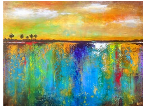
Jaime Byrd, "The Soaked Earth", 2024, oil on wood, 18x24x2 inches.

Asheville Art Museum , 2 South Pack Square at Pack Place, Asheville. Explore Asheville Exhibition Hall, Through Feb. 20 - "American Made: Paintings and Sculpture from the DeMell Jacobsen Collection". The exhibition features over 80 paintings and sculptures. Though many objects in the exhibition have been on view at other museums, ranging from the Metropolitan Museum of Art to the Smithsonian American Art Museum, this exhibition showcases the best of the DeMell Jacobsen Collection brought together in one location. "American Made" provides an in-depth look at the evolution of American creativity from the Colonial era to the early 20th century. The highlights include portraits by masters like Benjamin West, Thomas Sully, and Sarah Miriam Peale. There are sweeping landscapes by Thomas Cole, Asher B. Durand, and Jasper Francis Cropsey, and still lifes by Severin Rosen, Charles Ethan Porter, and Adelaide Coburn Palmer. The exhibition also features captivating genre scenes and the work of American artists who traveled to Europe, such as Mary Cassatt, John Singer Sargent, and Childe Hassam.