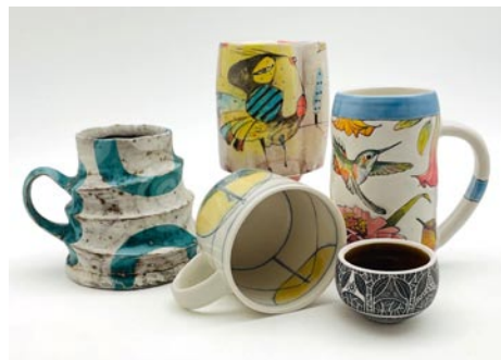
Just a few of the cups available at Cedar Creek Gallery's cup show