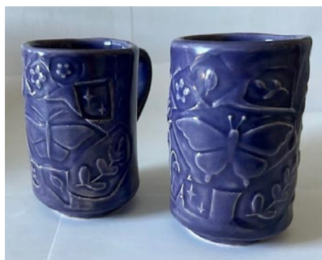
Works by a student from May River High School