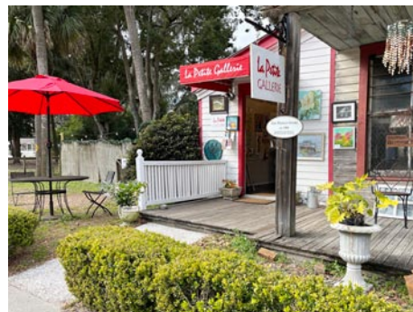
View outside La Petite Gallerie

who had been involved in starting up at least two other successful galleries in our little town. She had a knack for joining talented people of like minds to make magic happen. She was lucky enough to be friends with Babbie Guscio who had available space to rent in her 100 plus year old building that houses The Store.