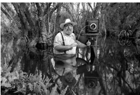
Clyde Butcher at work, photo not in the exhibit

Butcher's images of these treasured landscapes, including the Great Smoky Mountains, document the changing environment, capturing what is there today and encouraging us to enjoy the beauty of nature. His images speak for countless diverse places of wilderness and respite found throughout all of America, allowing us an appreciation of our land.