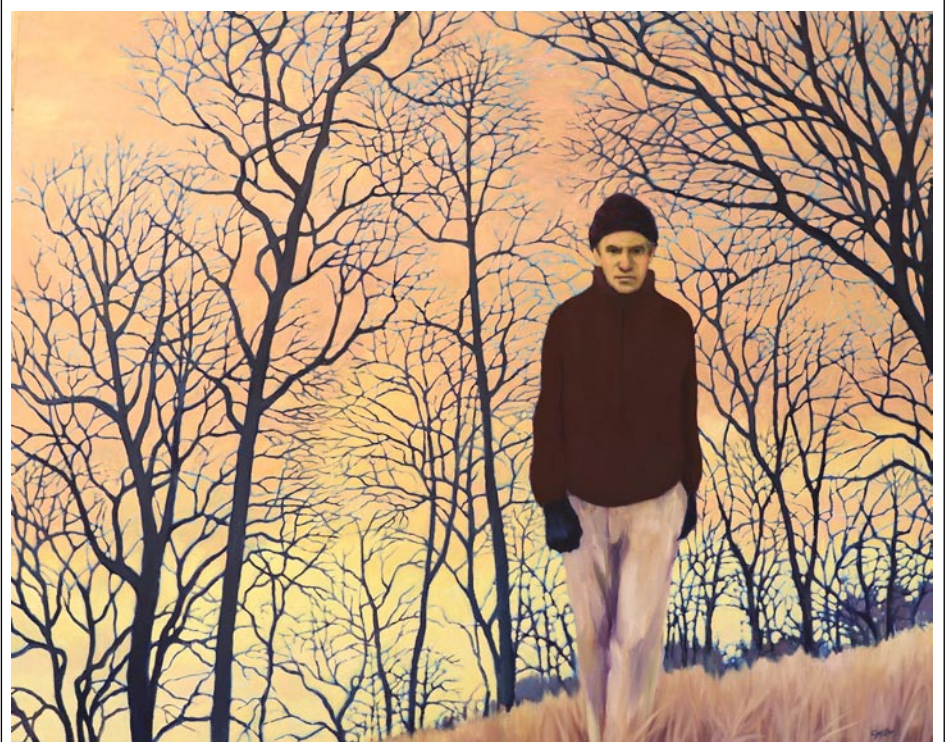
Winter Wanderer, 2021, Oil, 45 x 36 inches