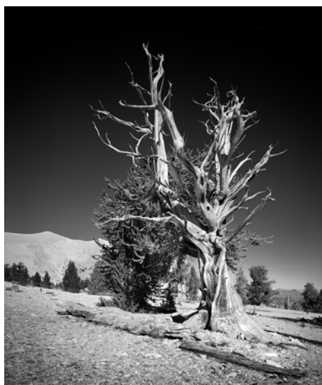
"Bristlecone Pine 3", photograph by Clyde Butcher

America the Beautiful includes 43 large-scale, black and white photographs