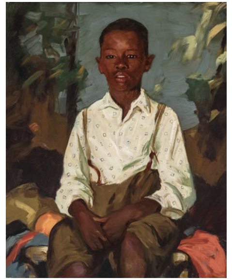
Robert Henri, American, 1865-1929, "Sylvester", 1914, oil on canvas, image: 32 x 26 in. (81.3 x 66 cm); frame: 39 1/4 x 33 1/4 in. (99.7 x 84.5 cm). Terra Foundation for American Art, Daniel J. Terra Art Acquisition Endowment Fund, 2017.2, L2023.2.4

Cumulatively, Triple Take invites the visitor to experience the Terra Foundation loans in a new way. The three contrasting curatorial approaches show how the Ackland's rich and deep collection can create