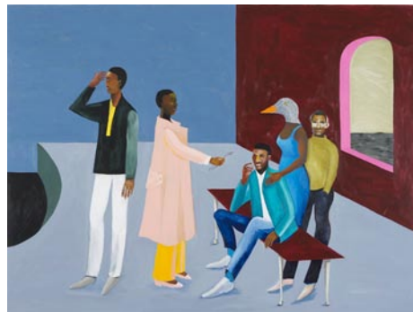
Lubaina Himid, "Le Rodeur: The Exchange", 2016, acrylic on canvas, 72 x 96 in., © 2024 Lubaina Himid, Courtesy of the artist and Hollywood Gardens, London; Photo: Andy Keate

The NCMA is the final venue for this exhibition, previously on display at the Philadelphia Museum of Art and the National Portrait Gallery in London, its organizing institution. Bank of America is