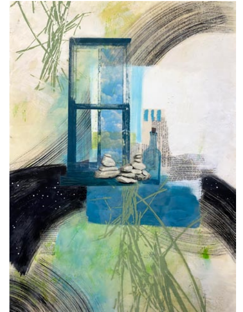
Work by Bridget Benton

trict area is often bustling with events and pedestrians, and the pedestrians rely heavily on a multitude of crosswalks to safely traverse the downtown Spartanburg area. The problem is that crosswalks are incredibly easy to overlook, they are rarely visually appealing, and they can even be quite dangerous. In an effort to remedy these issues, Chapman Cultural Center, the City of Spartanburg, and the Spartanburg Area Chamber of Commerce came together to organize the Creative Crosswalk Project. For more info visit ( https://www.chapmanculturalcenter.org/pages/blog/detail/article/c0/a1555/ ).