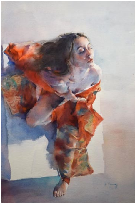
Work by J J Jiang

City Art Gallery , 511 Red Banks Road, Greenville. Ongoing - The gallery features the works of established regional and national artists and craftspeople. The gallery offers an extensive collection of paintings, sculpture, ceramics, glass, drawings and photography. Hours: Mon.-Fri., 10am-6pm & Sat., 10am-4pm or by appt. Contact: 252/353-7000 or at ( www.CityArtGreenville.com ).