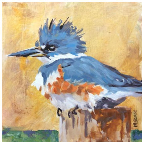
Work by Murray Sease

For further information check our SC Commercial Gallery listings or visit ( lapetitegallerie.com ).