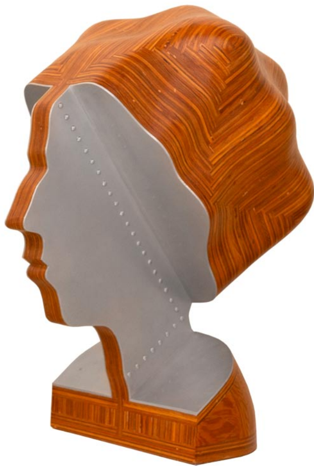
Profile and Right Angle , c. mid 1970s, wood, aluminum, 24 1/2 x 13 x 20 inches