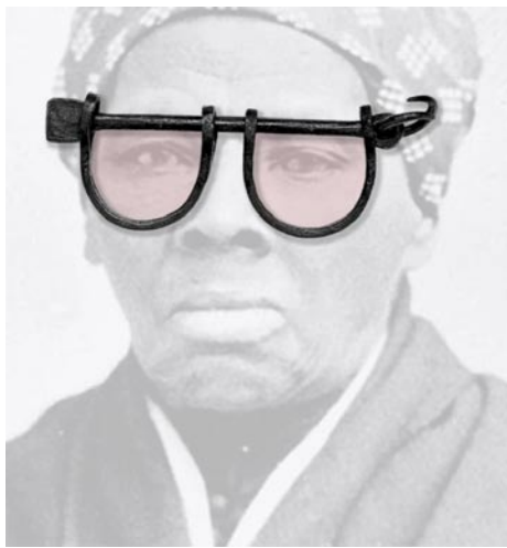
"Rose Colored" 2019, by Colin Quashie

The Morris Center for Lowcountry Heritage is a learning and exhibition center dedicated to preserving and cultivating the history, culture and the spirit of Ridgeland and its surrounding counties. Housed in a collection of vintage buildings, with the architecturally distinctive Sinclair Service Station as its focal point, the center features ever-changing exhibi-