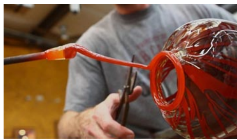
View of the cowboys at work at One Eared Cow Glass

Artista Vista begins Friday night, Apr. 11, with the annual Gallery Crawl throughout The Vista District. Join us from 6-9pm for a fun evening in The Vista's distinctive galleries. Be sure to visit Richland Library Main (1431 Assembly St.) for the opening of Artista Vista's Juried Exhibition, Rooted .