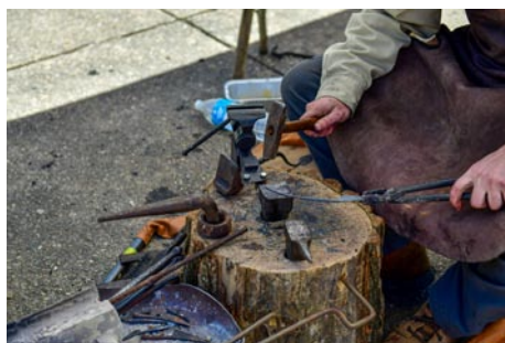
A metal work demonstration