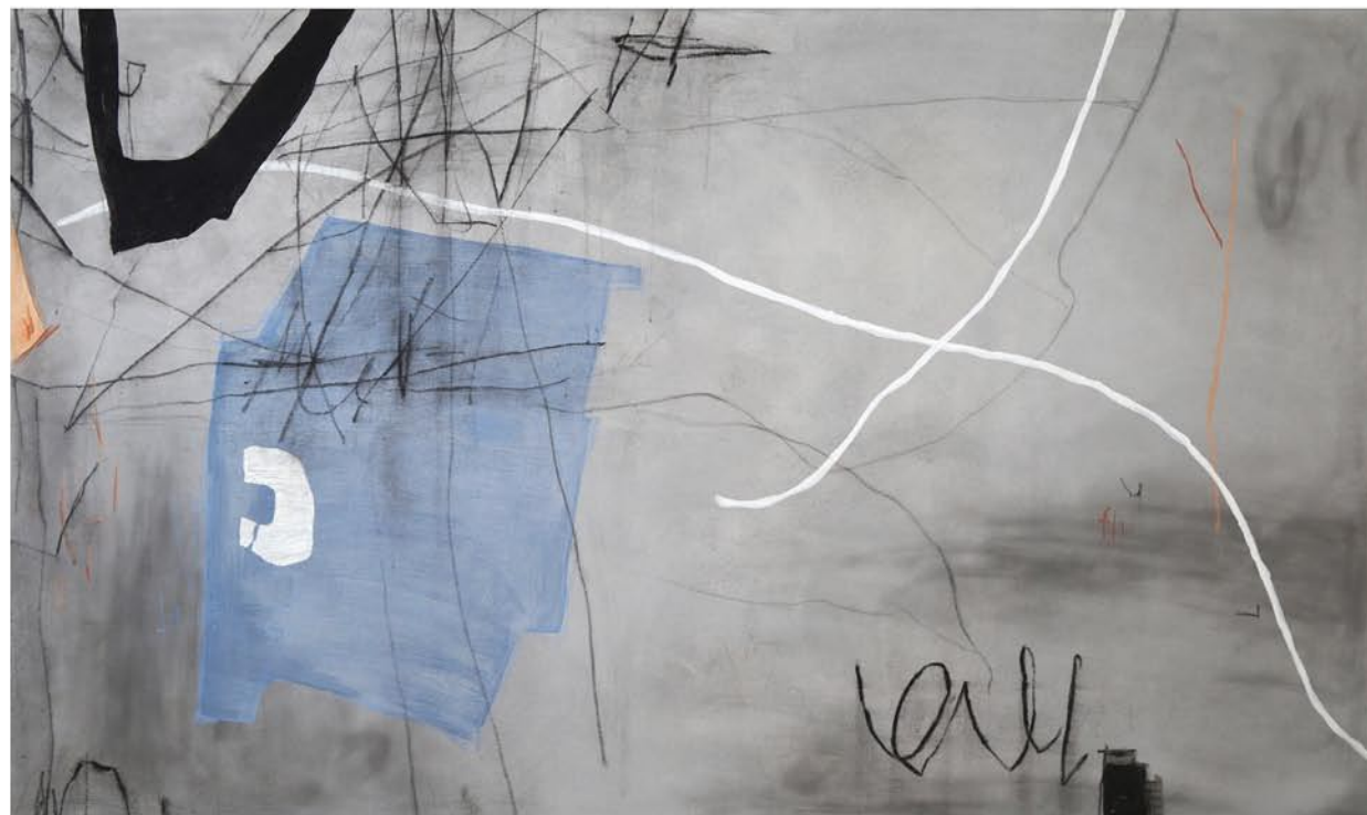
Ecco acrylic on canvas 36 x 60 in.