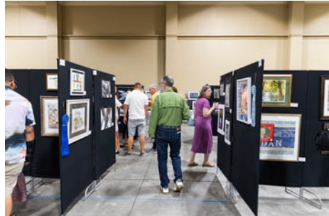
View of a previous "Judged Fine Art & Photography Competition and Exhibition," at the North Charleston Arts Fest.

The Olde Village , E. Montague Ave., off Park Circle, North Charleston. May 3, 2025, from 5-8:30pm - "2025 Arty Block Party". The street art market features vendor booths with local artists, makers, and arts-related businesses and organizations, and live music. It's an art-filled evening of fun for the whole family! Contact: call 843/740-5854, or at ( NorthCharlestonArtsFest.com ).