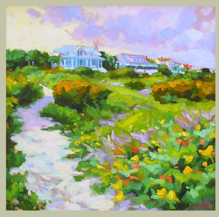
Sullivan's Beach Path