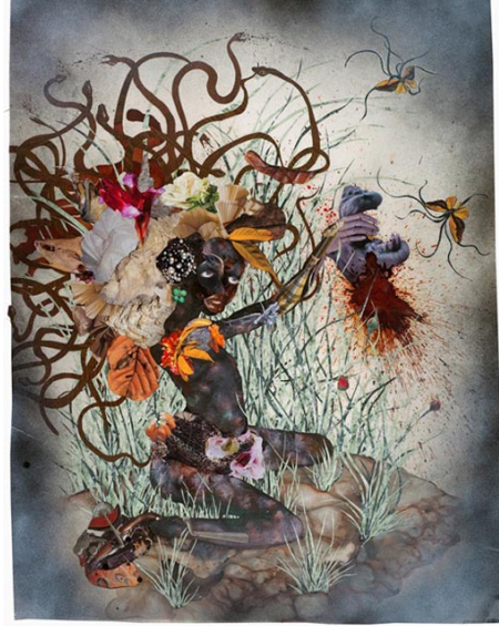
Wangechi Mutu, The Bride Who Married a Camel's Head , 2009. Mixed media on Mylar, 42 x 30 inches (106.7 x 76.2 cm). Deutsche Bank Collection, Frankfurt, Germany. Courtesy of the artist and Susanne Vielmetter Los Angeles Projects, CA, USA. © 2009 Wangechi Mutu. Photo by Mathias Schormann.

Duke University in Durham, NC, is presenting Wangechi Mutu: A Fantastic Journey, on view through July 21, 2013, at the Nasher Museum. The exhibition presents Wangechi Mutu's first major solo museum exhibition, the most comprehensive and experimental show for this internationally-renowned multidisciplinary artist. With over 40 works from the mid 1990s to the present, the exhibition incorporates all aspects of her current practice including collage, drawing, installation, sculpture, performance and video. A central element of the exhibition is her firstever animated video. Another highlight is Page 10 - Carolina Arts, June 2013