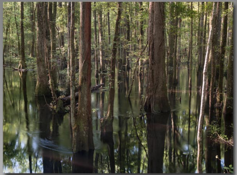
Great Swamp #1, Jasper County SC 041613