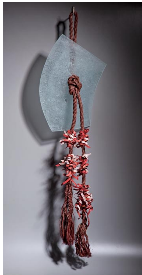
Work by Meris Barretto

continued above on next column to the right