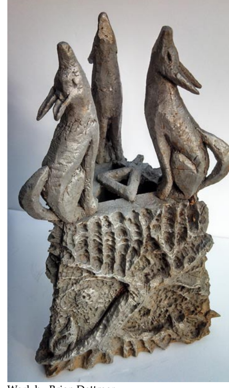
Work by Brian Dettmer

The Mountain Sculptors exhibit features pieces by 25 artists. Each submitted up to eight entries, and a select jury chose the sculpture to be included in the show. The work, which ranges from painted carved wood, alabaster, steel, and bronze, to terracotta, paper, clay, and found objects, has no