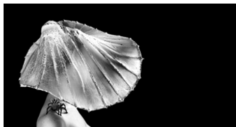
Work by Crystal Vinson

Exposed is an exhibition of photographs by Crystal Vinson and Ginia Worrell. Each defines "exposed" as disarmed and vulnerable but each exposes through opposite processes, Vinson subtractive and Worrell, additive. Vinson's photographs are hyper focused fashion images that undermine that glamorous artifice revealing a darkly humorous individual vulnerability. Worrell's photographs assert the most up close and personal exposure of herself and her individual, everyday life.