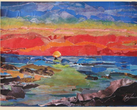
Just Beautiful, collage by Babs Ludwick

Reception on Saturday June 22, 2 - 5 p.m.