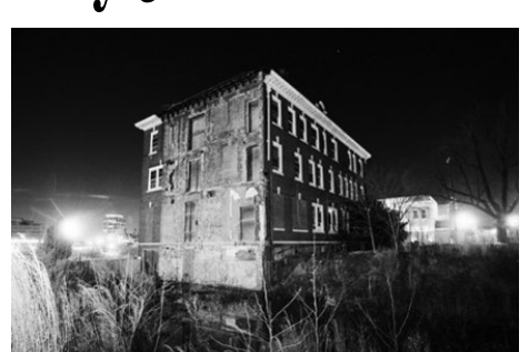
1110 Main Street, McPherson's Hospital. Photo