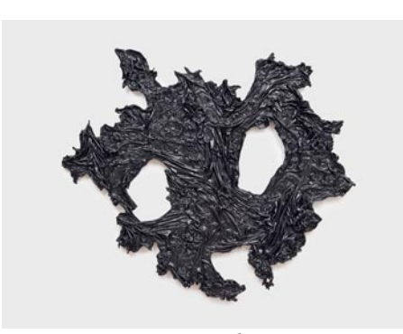
Allana Clarke, "I Feel Everything", 2023. © Allana Clarke, courtesy of Zander Galerie, Cologne.

The visceral performance art and sensual sculptures of Detroit-based artist Allana Clarke (b. 1987) embody a profound interest in conveying the lived narratives of Black women within the African diaspora. continued above on next column to the right | Her deliberate choice of materials, such