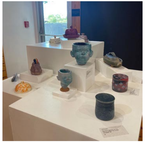
View of works in the exhibition.

This exhibit features several butterinspired works from ECU ceramics students and alumni alike that showcase their talent, creativity, and skill