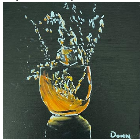
Work by Donn McCrary

continued above on next column to the right