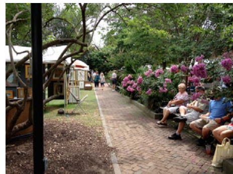
View of a previous outdoor show at Marion Sq.

Charleston City Night Market , between Church Street and East Bay Street, Charleston. Fri. & Sat. nights, from Mar. - Dec. - "2024 Charleston City Night Market". We are the largest art market in the Southeast and have won Charleston's choice for Local Art in 2018 and 2019, 2020, 2021 & 2022. The Night Market began as an Artisan/Hand Crafted only market in 2012, and now has over 200 various artists represented. This dynamic and diverse group has become an integral part of the Charleston City Market. Hours: Fri. & Sat., 6:30-10:30pm. For info e-mail to ( chasnightmarket@gmail.com ).