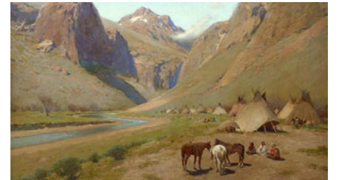
Henry François Farny, "Indian Encampment", 1911, Montgomery Museum of Fine Arts, Gift of the Ida Belle Young Art Acquisition Fund, 2021.3