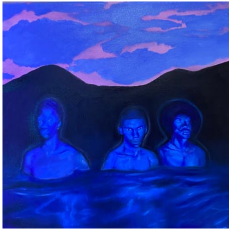
Work by Logan Foster

Throughout downtown Spartanburg's Cultural District, Ongoing - The Creative Crosswalk Project is a public art initiative in which local artists and designers design and paint a series of crosswalk murals, transforming the crosswalks into works of art, on Main Street in Spartanburg, SC. The downtown cultural district area is often bustling with events and pedestrians, and the pedestrians rely heavily on a multitude of crosswalks to safely traverse the downtown Spartanburg area. The problem is that crosswalks are incredibly easy to overlook, they are rarely visually appealing, and they can even be quite dangerous. In an effort to remedy these issues, Chapman Cultural Center, the City of Spartanburg, and the Spartanburg Area Chamber of Commerce came together to organize the Creative Crosswalk Project. For more info visit ( https://www.chapmanculturalcenter.org/pages/blog/detail/article/c0/a1555/ ).