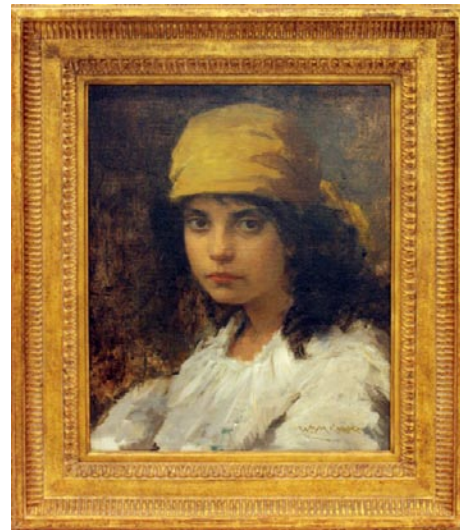
Work by William Merrit Chase, part of the Foundations Exhibition

Full Circle Arts , 42-B Third Street NW, Hickory. Ongoing - Featuring works by member artists in a variety of mediums. Full Circle Arts is a not-for-profit educational organization whose mission is to encourage public appreciation and education for the arts. Hours: Wed.Fri., 11am-5pm & Sat., 10am-2pm. Contact: 828/322-7545 or at (www.fullcirclearts.org).