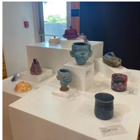
Works by members of the ECU Ceramics Guild, Part of the exhibit "Like Buttah!"

sculptures from emerging and established artists working in all 3D media suitable for the outdoors. There are currently 19 sculptures installed around the pond. The landscaped and natural areas have a focus on NC native plants and trees. As an extension of this park, a sculpture is installed in the downtown area of Seagrove. Hours: Mon.-Fri., 8:30am-4pm. Contact: 336/873-8291 or at (www.cb sculpture-garden.com).