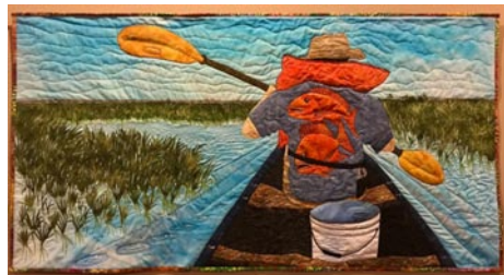
Work by Lynn Gettle

Dan Diehl crafts engaging puzzles and maps - so useful to track summer adventuring. Lynn Gettlefinger layers intricate patterns of fiber creating delightful quilts that touch on fond summer memories.