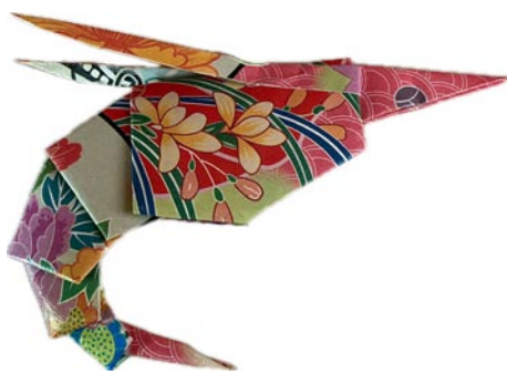
Work by Regina Semko

Dedie Story interweaves textures and layers of glass creating functional, summery