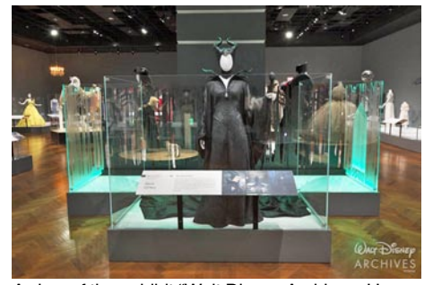
A view of the exhibit "Walt Disney Archives, Heroes & Villains: The Art of the Disney Costume" at a previous exhibition space.

The South Carolina State Museum in Columbia, SC, is presenting a fan-favorite blockbuster exhibition created by the Walt