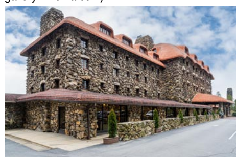
View of the Gallery of the Mountains at Grove Park Inn, Celebrating its 40th anniversary.

Gallery Minerva Fine Art, 8 Biltmore Ave., Asheville. Ongoing - Featuring painting, sculpture, photography, ceramics and glass by local and regional artists. Hours: Mon.-Thur., 11am-6pm;Fri. & Sat., 11am-8pm; & Sun., noon-5pm. Contact: 828/255-8850 or at (www. galleryminerva.com).