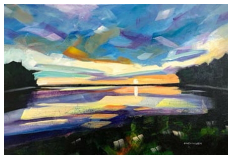
Work by Chris Wagner

Carolina Creations Fine Art and Contemporary Craft Gallery , 317-A Pollock Street, New Bern, NC. Ongoing - Featuring fine art and contemporary crafts including pottery, paintings, glass, sculpture, and wood by over 300 of the countries top artists. Hours: Mon.-Sat., 10am-6pm, & Sun., 11am-3pm. Contact: 252/633-4369 or at ( www.carolinacreations.com ).